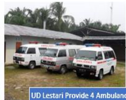
UD Lestari Provide 4 Ambulance free for community