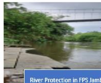
River Protection in FPS Jambi