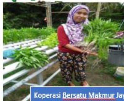
Koperasi Bersatu Makmur Jaya , Support Women Livelihood