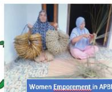
Women Empowerment in APBML Jambi