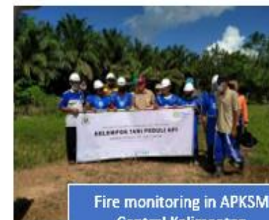
Fire monitoring in APKSM Central Kalimantan