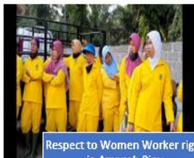
Respect to Women Worker right in Amanah Riau