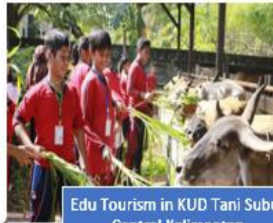
Edu Tourism in KUD Tani Subur Central Kalimantan