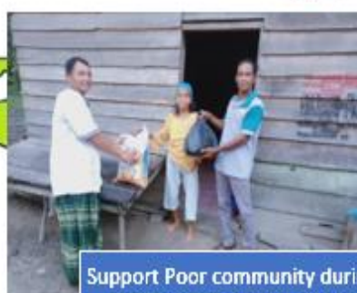
Support Poor community during pandemic in APBML Jambi