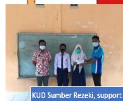
KUD Sumber Rezeki, support the Education for Smallholders child