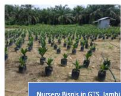
Nursery Bisnis in GTS, Jambi